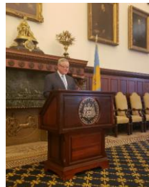
Mayor of Philadelphia announces that the city of Philadelphia will NOT renew the PARS contract with ICE